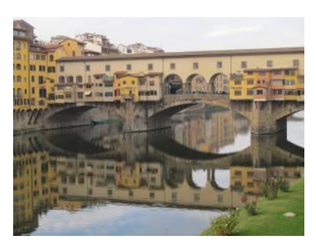
March 11: Travel by train to the Renaissance city of Florence. Take a walking tour of the city while creating your own art.